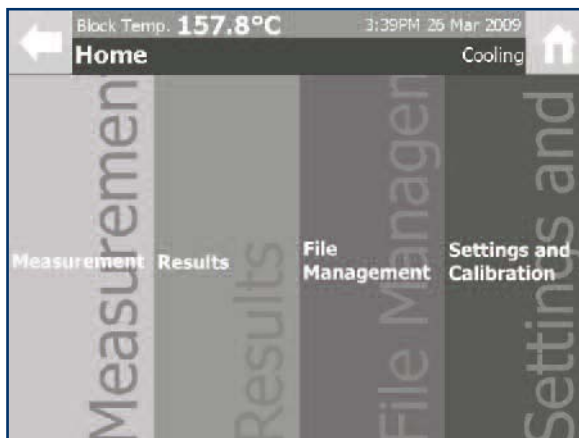
SMP40 Interface - Homepage