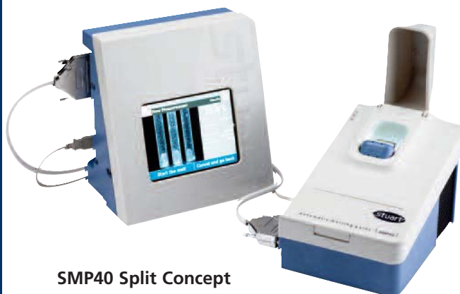
SMP40 Split Concept