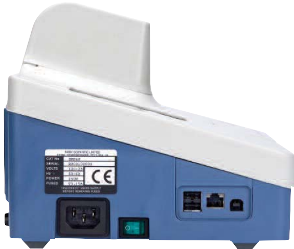
SMP40 Side Profile